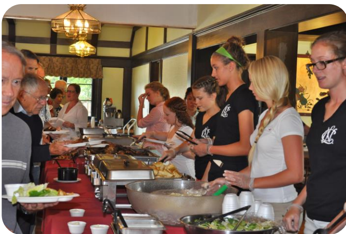
Local Students Volunteering at the St. Joseph BBQ.

The Brothers want to thank all who supported the event and who volunteer their time.