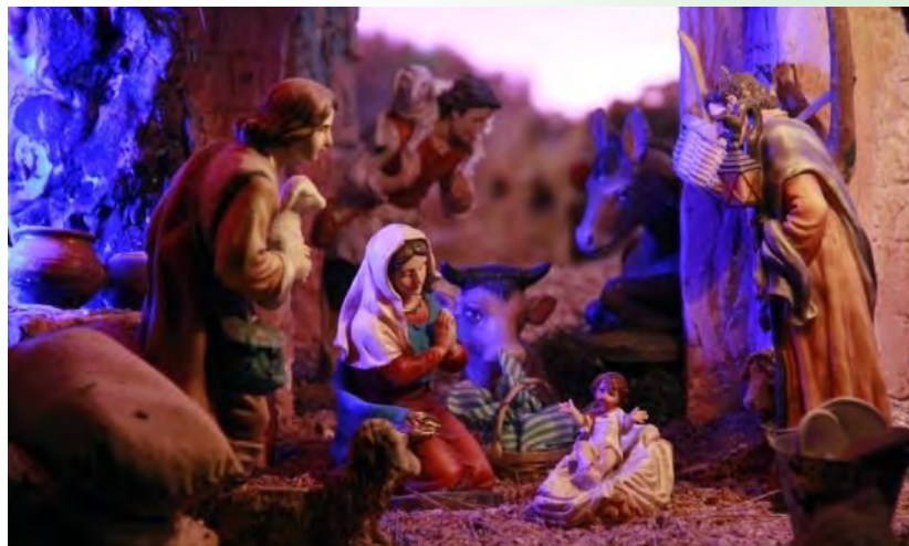
Nativity Scene at Albergue San Juan de Dios in Ecuador. It has 4.000 pieces that conforms the entire Scene reflecting different passages related with Jesus' birth narrated in the Bible.